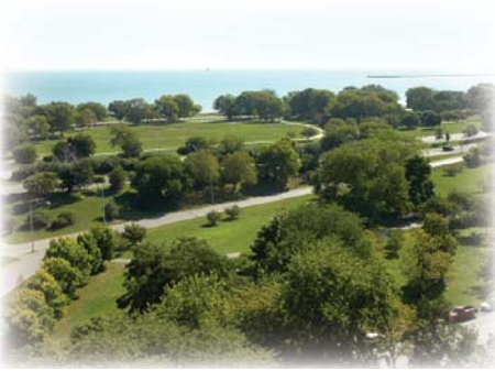
The actual view looking east from the 11th floor of the former Admiral building.

Following a strategic planning process in 2003, The Admiral's board found itself facing yet another need to change and adapt if it intended to grow and expand its mission to "provide a quality environment for seniors" within an urban setting that "supports personal independence and promotes health and wellness." Redevelopment was needed to address physical plant, programmatic, regulatory, operational and design obsolescence. Thus, in 2007, residents took up temporary quarters in nearby host facilities and plans were initiated to redevelop and reposition this historic community as The New Admiral at the Lake.