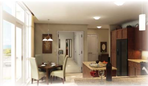
Renderings of projected apartment at The New Admiral at the Lake.

Following a strategic planning process in 2003, The Admiral's board found itself facing yet another need to change and adapt if it intended to grow and expand its mission to "provide a quality environment for seniors" within an urban setting that "supports personal independence and promotes health and wellness." Redevelopment was needed to address physical plant, programmatic, regulatory, operational and design obsolescence. Thus, in 2007, residents took up temporary quarters in nearby host facilities and plans were initiated to redevelop and reposition this historic community as The New Admiral at the Lake.