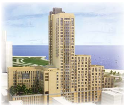
Rendering looking toward The New Admiral and beyond to Lake Michigan from the south.

When completed, The New Admiral at the Lake will be a 31-story continuing care retirement community (CCRC) offering life care retirement living at its stunning site on the shores of Lake Michigan. In addition to 200 residential apartments ranging in size from one-bedroom to three-bedroom homes, the community plans to provide 39 assisted living and 17 memory support accommodations, as well as 36 private skilled nursing rooms—many accommodations offering breathtaking views of Lake Michigan and downtown Chicago which is a 10-minute ride away.