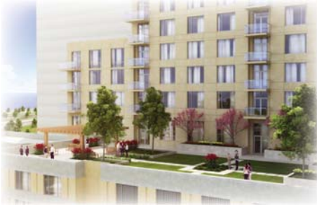
Rendering of The New Admiral at the Lake rooftop terrace area.

In addition to offering the full life care continuum, The New Admiral at the Lake will provide a host of amenities and services including wellness and fitness center, indoor swimming pool and spa, dining options, landscaped roof terraces and gardens, library and resource center, and media room. Indoor parking will be available for residents, and a portion of the building's ground floor, facing Foster Avenue, is earmarked to provide retail space to serve Admiral residents as well as the community at large. Currently, nearly two-thirds of the planned residential apartments are reserved by returning Admiral residents and new prospective residents who have placed deposits equal to 10% of the proposed entry fees.