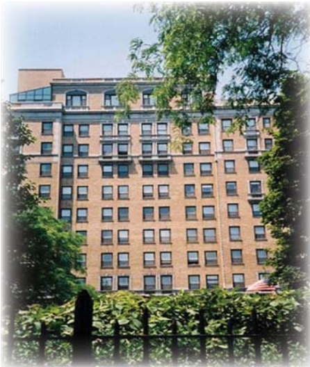
The former Admiral at the Lake building.