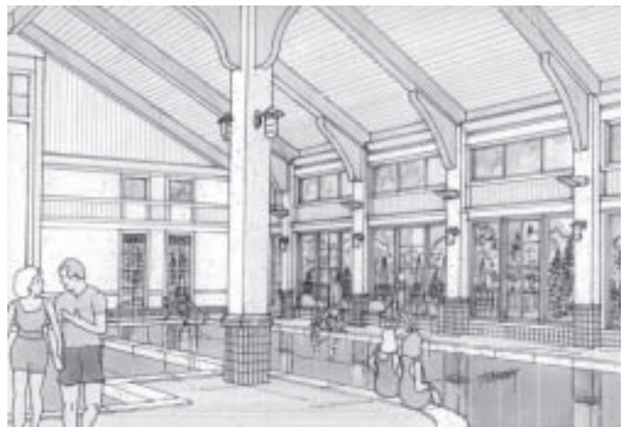
Architect's rendering of the lap pool in Kendal at Longwood's new wellness center.

Final design of the Kendal at Longwood wellness center is now complete. The wellness center will be attached by a connecting bridge to the Cumberland wing of the Kendal health center and will include therapies, fitness rooms, separate therapy and lap pools, and a multipurpose room for floor exercises and dance. A fund raising campaign to help support the cost of the new center was organized by a committee of Kendal residents and has generated $1.7 million in donations and pledges to date. Groundbreaking is projected for fall 2002.