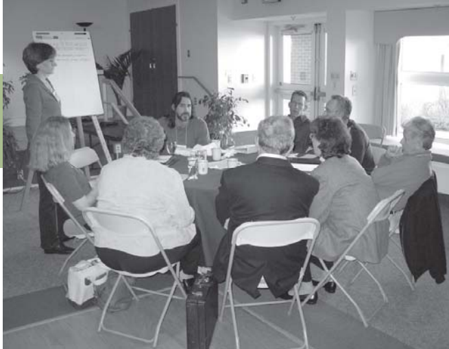
Barclay Friends focus group at work.