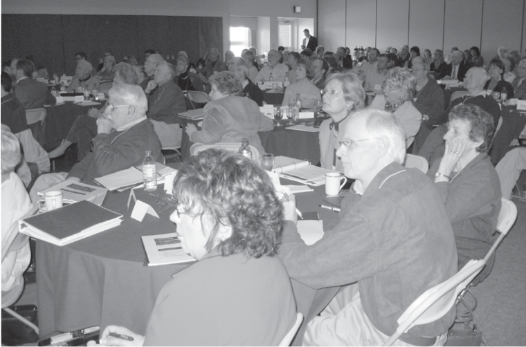
The 2006 Kendal System All Communities Gathering gets underway in the Kendal at Ithaca auditorium.