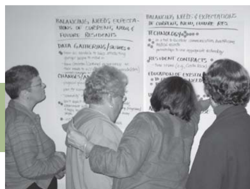
Prioritizing ideas for future programs and directions.