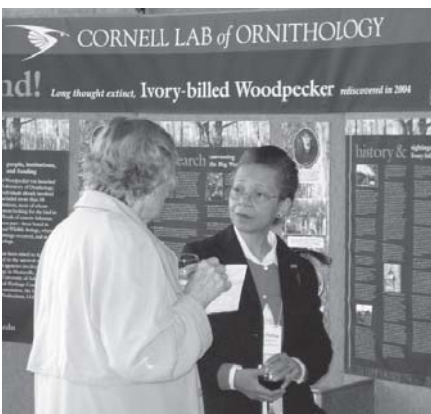
Dinner and socializing at the Cornell Laboratory of Ornithology.