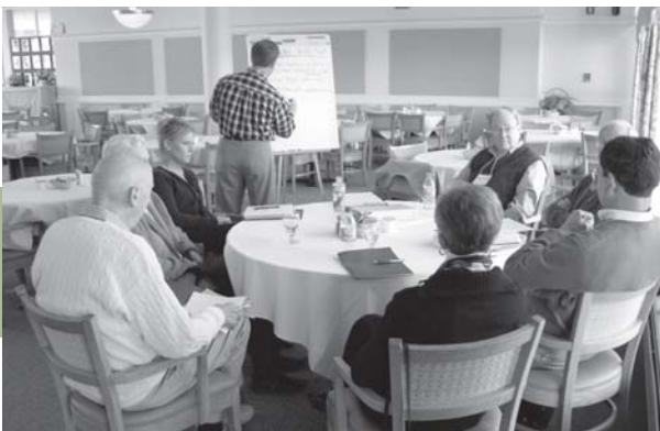
Kendal at Lexington break-out session.